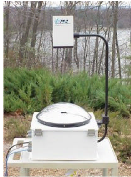
Model TSI-440 Total Sky Imager

The side-by-side cloud images show a raw image before any processing has been performed and the same image with a software filter applied. The filter, a sophisticated image-analysis algorithm, clearly defines the clouds so that fractional cloud cover can then be calculated.