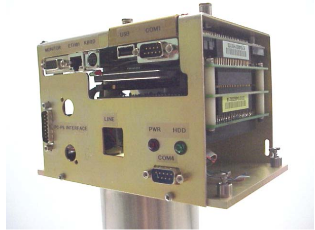
AIRHUB Met Data Receiver

The AIRHUB is connected to a vertical 400 MHz RF telemetry receive antenna. This antenna is typically mounted low on the aircraft. Received data is automatically ingested, and a cyclical redundancy check is used to verify telemetry data integrity before storing internally. It acts as an "Internet appliance" data server and can be remotely administered and monitored via TCP/IP.